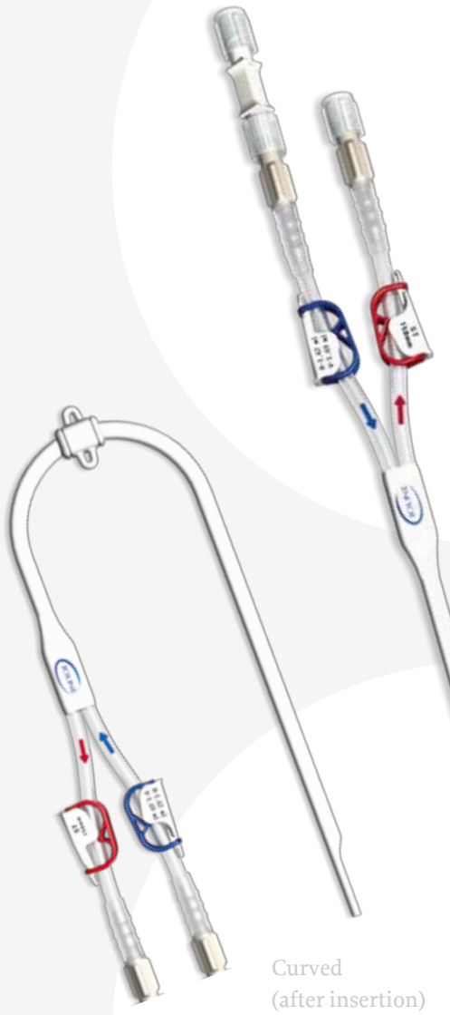
Curved (after insertion)